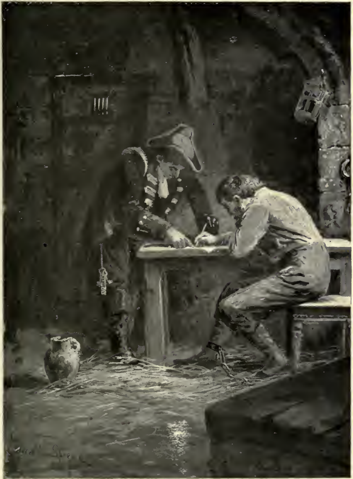
"I WILL DRAW A PLAN."—Page 82.